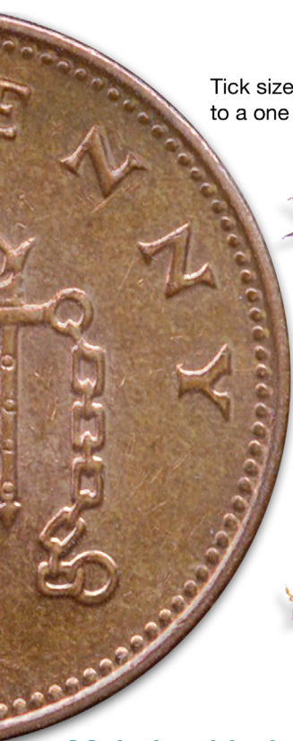
Tick sizes compared to a one penny coin